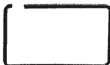
Handle Tie 23936-G